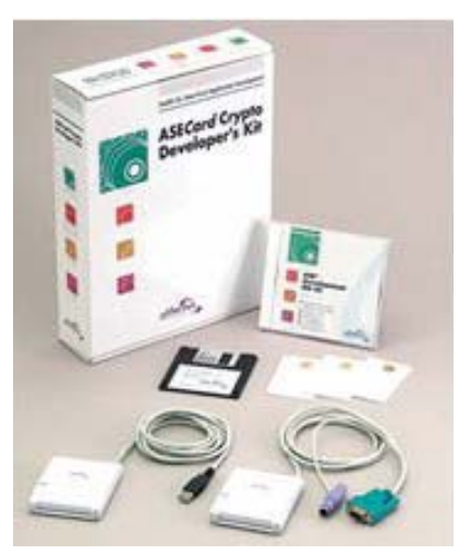
ASECard Crypto SDK

ASECard Crypto is based on ASEPCOS, Athena's most advanced smart card operating system. ASEPCOS is designed with the maximum level of security in mind. Its built-in security features, smart memory management, and large user memory, make it the perfect platform for PKI, Authentication, and Digital Signature solutions.